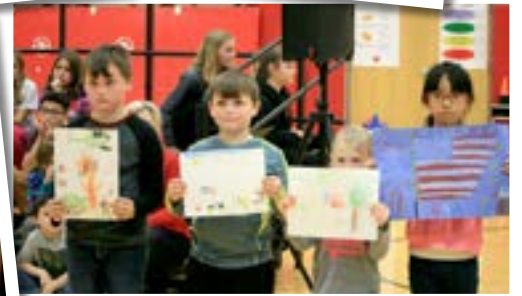
Student winners of the patriotic poster contest were announced.