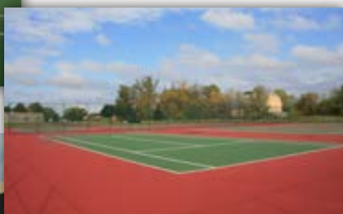
New tennis courts are still being finished.